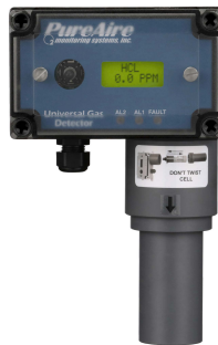
Universal Toxic Gas Detector