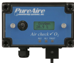
Oxygen Deficiency Monitor

Example of Compatible Monitors - Please contact PureAire for a complete list