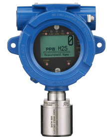
LEL Combustible Gas Detector