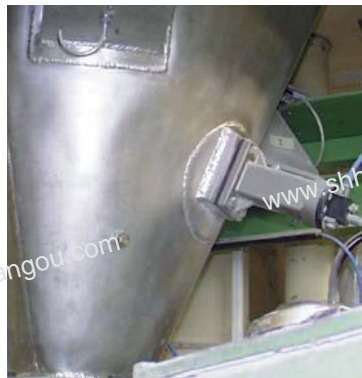
Cleaning bunker walls