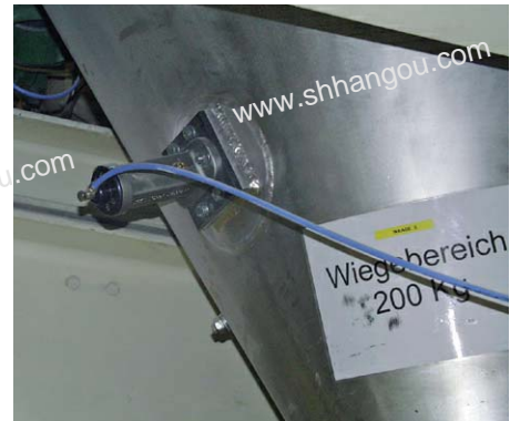
Cleaning weighing containers